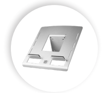
R-GO MORELIA LAPTOP HOLDER