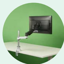
R-Go Caparo 4 D2