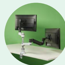
R-Go Caparo/Zepher Twin