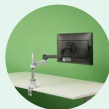
R-Go Zepher 4 C2