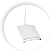
R-GO MORELIA DOCUMENT HOLDER