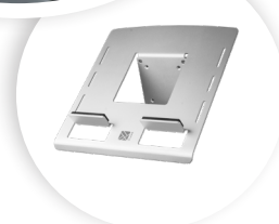
R-GO MORELIA LAPTOP HOLDER